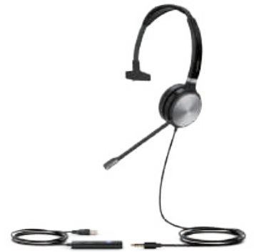
UH36 Mono Teams UH36 Mono UC

Deeply integrated with Yealink IP phones that the advanced features, such as volume synchronization and multiple calls control, are just right at your fingertips.