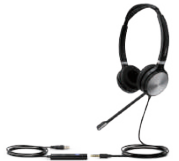
UH36 Dual Teams UH36 Dual UC